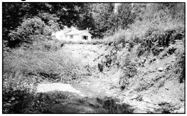
Sites of erosion, such as the one shown above in the Town of Collins, will be addressed by the Partnership Program.

The Erie County Soil and Water Conservation District has received official word from the NYS Department of Environmental Conservation that it has been awarded a grant in the amount of $326,706 to address streambank erosion problems in the Eighteenmile Creek Watershed. The funds were made available through the Environmental Protection Fund. The state grant will be matched by funds from private landowners, participating municipalities, the District, and the USDA Natural Resource Conservation Service, bringing the total value of the project to $654,000.