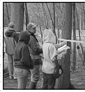
and techniques of forestry from a

We hope that you will join us for this year's Envirothon to be held at Chestnut Ridge Park on April 7st and April 28th. For more information or to register for the 2005 Erie County Envirothon, please contact the District office at 652-8480 or visit the District's website at www.ecswcd.org. Further informa- Participants learn about principles tion on the New York State Envirothon is available at DEC Forester. www.nysenvirothon.org. •