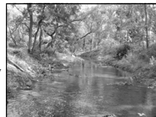
Results of a stream debris removal project in Ellicott Creek

Almost one year to the day, the last of the prioritized stream debris removal projects resulting from the October 2006 snow storm was finally completed. The impressive results of the many hours focused on assessing and mapping debris sites, filing permits, contacting public officials, working with landowners and coordinating contractor activities totaled approximately 180 debris sites cleared of potential flooding and erosion impacts to local roads, bridges and properties. Areas that received assistance included Alden, Amherst, the City of Buffalo, Cheektowaga, Clarence, Depew, Elma, Grand Island, Hamburg, the City of Lackawanna, Lancaster and Newstead. The District would like to thank all the involved landowners, contractors, state and federal agencies and town and county officials, especially the Erie County Emergency Services and Department of Public Works, for all their contributions and patience in accomplishing this extensive undertaking.